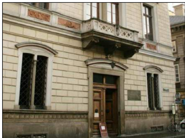
The Polish Academy of Arts and Sciences ul. Sławkowska 17

This is a day trip that includes a funicular ride to the top of Mount Gubałówka with its beautiful panoramic views, time to explore traditional craft shops, the Tatra Museum, and the old wooden village of Chocholów before journeying back to Kraków. Tours depart at 8.45 am from the bus park at 11 Powiśle Street, opposite the Sheraton Hotel or between 8:00 and 8:30 am if being picked up from a hotel.