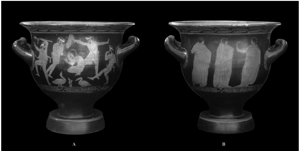
Fig. 3. Athenian red figure bell krater, woman bathing surprised by Silens (A); two youths and boy (B). Ripe Classical period, the Dinos Painter, ca. 420–410 BC. Institute of Archaeology, Jagiellonian University, Kraków, inv. no. 331, height 0,30 m.

University Museum (four objects 13 ). New pictures of all the objects were taken as well as section drawings of all the vessels and drawings of decorations and other details (e.g. inscriptions) of the objects where those elements were poorly visible or poorly preserved or omitted. Detailed descriptions of the vases were made regarding both the techniques (e.g. a description of ware or fabric using the Munsell's Soil Colour Chart), shapes, decorations and the state of preservation. The most exact classification and dating possible of all the objects was conducted on the basis of a detailed analysis and various analogies.